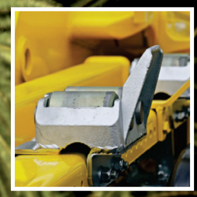
Zinc-plated container supports